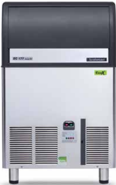
Medium gourmet cube 20g, 30mm dia x H 34mm

ECM 177 AS Medium gourmet cube 20g, Ø30mm x 34mm