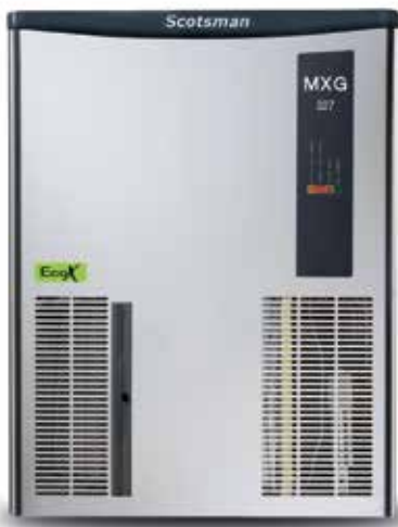
Medium gourmet cube 20g, 30mm dia x H 34mm