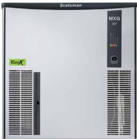
Medium gourmet cube 20g, 30mm dia x H 34mm